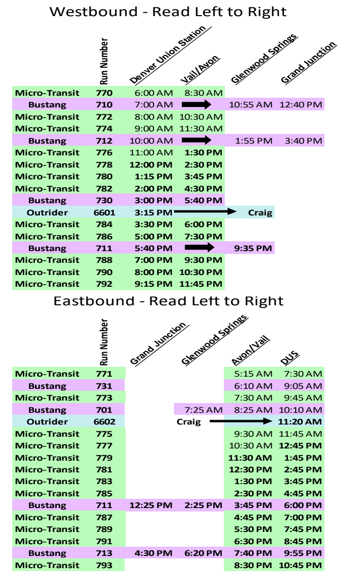
Figure 3: Proposed Shuttle Schedule