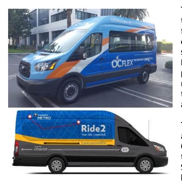
Figure 2: Example Passenger Van Shuttles

The new service will provide more frequent service than the existing Bustang West Line, to allow riders flexibility in travel times. Adding vehicles to the fleet on the corridor also allows the operator to adjust schedules and routes as needed. Like the existing Bustang West Line, the service will capitalize on local public transit systems that connect to local transit routes. The shuttle service will continue to use a public transit type fare structure, which is a more affordable alternative than existing private charter services.